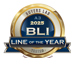
Konica Minolta Business Solutions Europe 2025 A3 Line of the Year Award