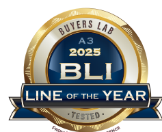
Konica Minolta Business Solutions Europe 2025 A3 Line of the Year Award