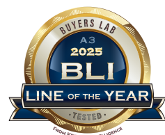
Konica Minolta Business Solutions Europe 2025 A3 Line of the Year Award